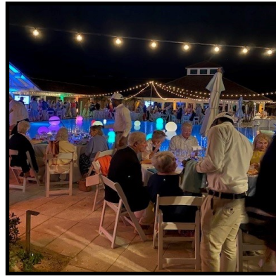
Beach Ball 2023