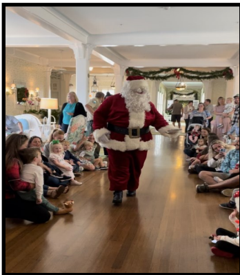
Santa at the Gasparilla Inn