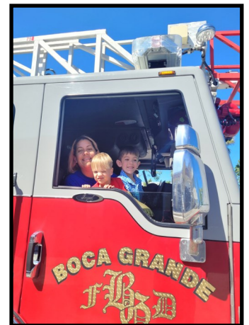
Annual Field Trip to Boca Grande Fire Department