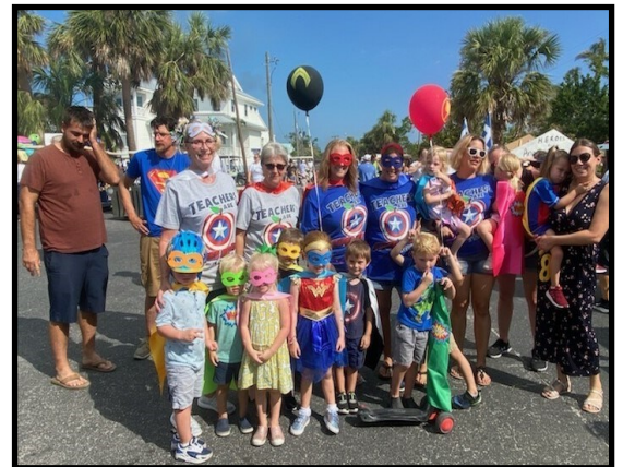
Women's Club Bike & Golf Cart Parade